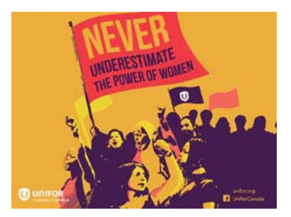
Calling all Unifor women! Register today for the union's online International Women's Day virtual event: IWDigital.

More members speak out as our Black History Month video series continues. Watch them all on this Facebook playlist.