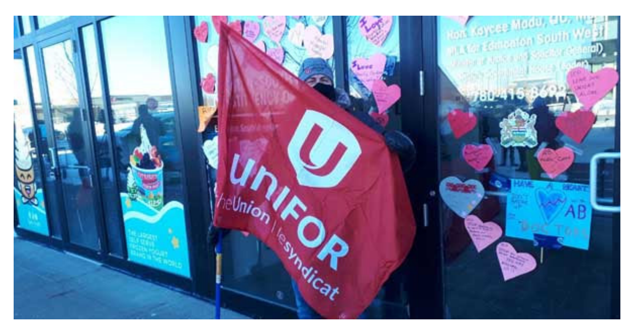
Alberta members #StandUpToKenny and United Conservative Party MLAs at a 'Broken Hearts Protests' on Valentine's Day weekend.